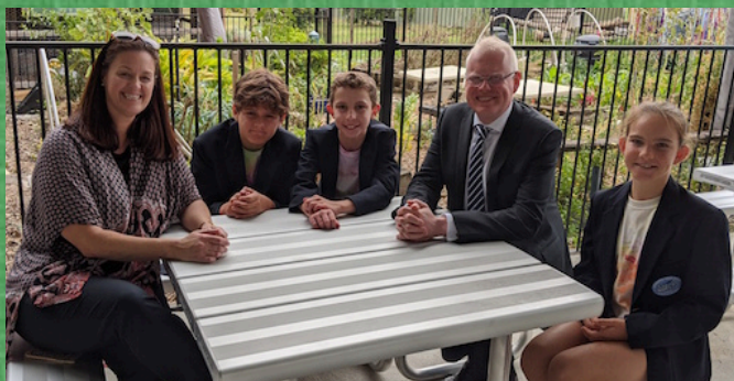
Official Opening of Outdoor Learning Area