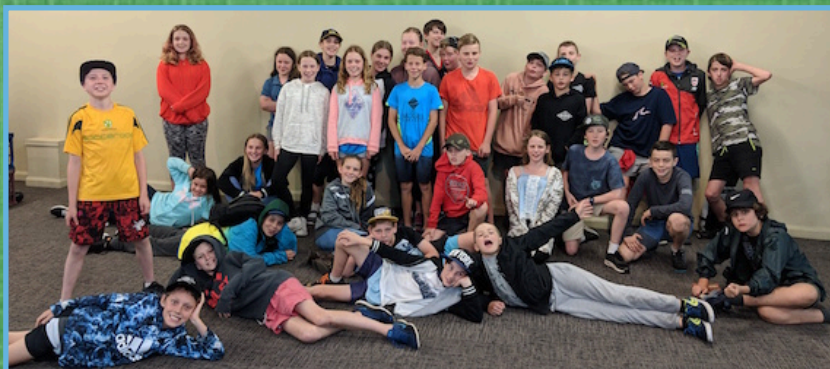
Stage 3 Campers