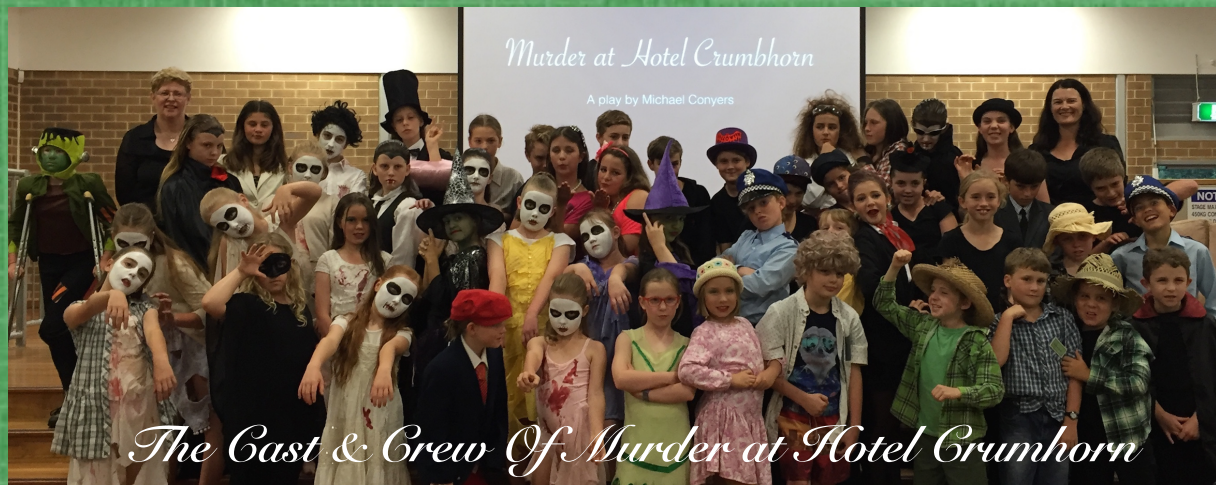
The Cast & Crew Of Murder at Hotel Crumhorn